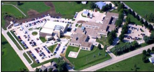
Greater Regional Medical Center