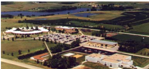
Southwestern Community College