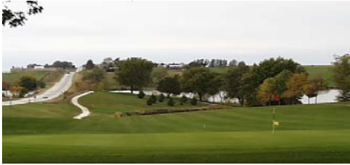
Crestmoor Golf Club

Properties in the sub-division are close to: