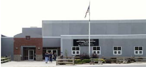
Southern Prairie YMCA